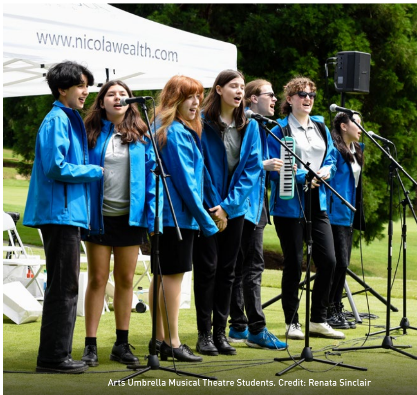
Arts Umbrella Musical Theatre Students.