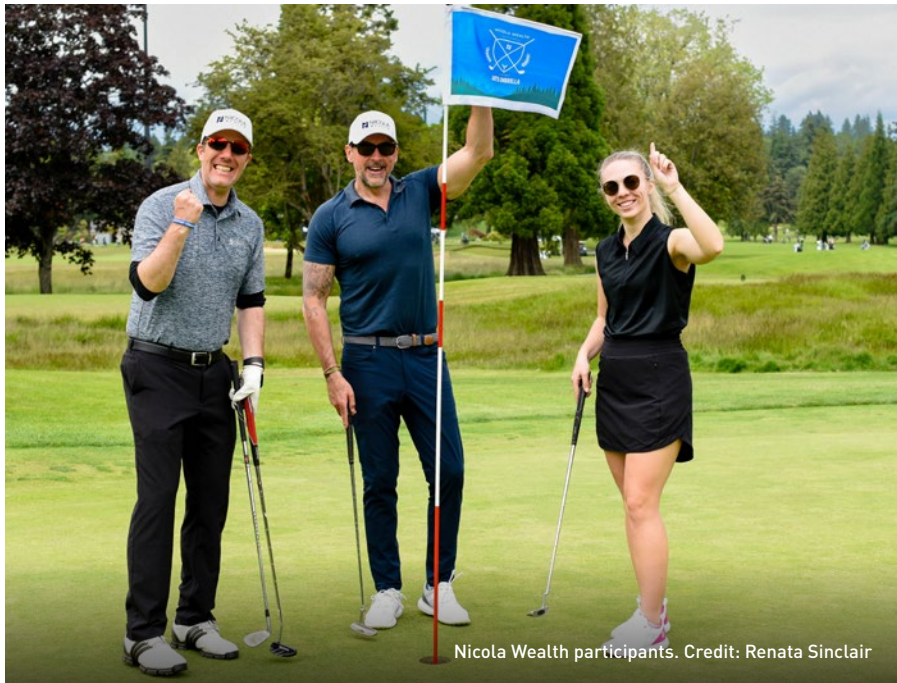
Nicola Wealth participants.