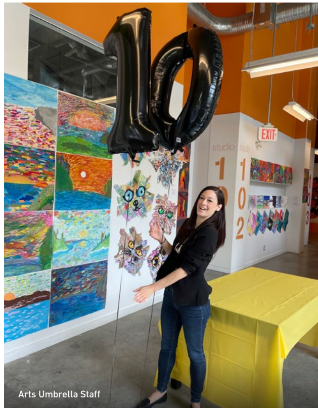
Arts Umbrella Staff