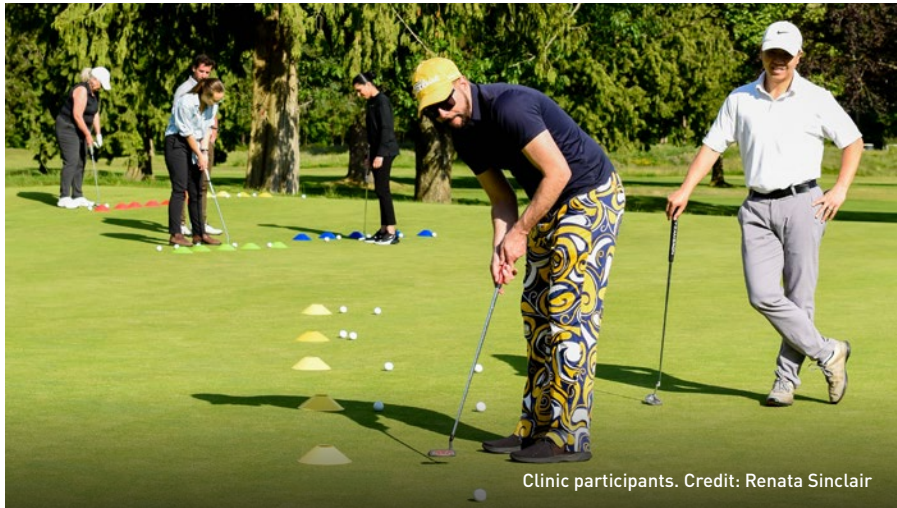
Clinic participants.