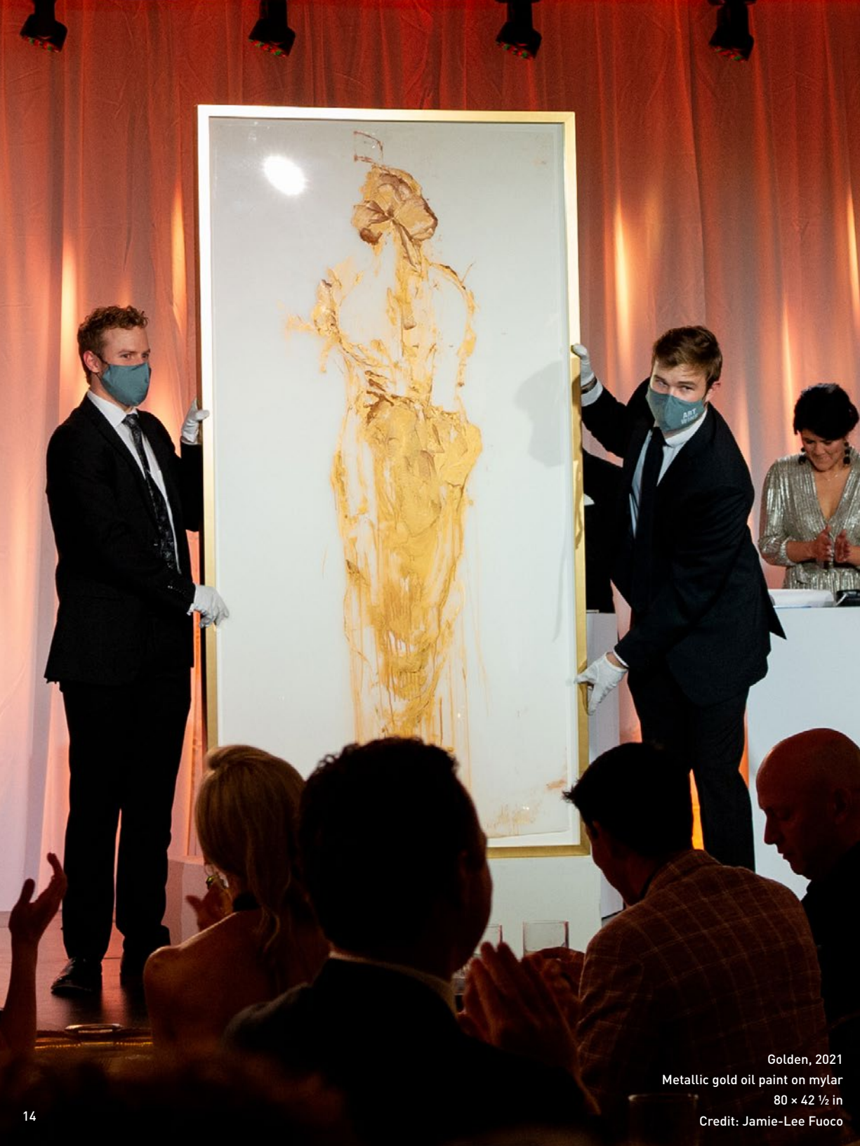
Golden, 2021 Metallic gold oil paint on mylar 80 × 42 ½ in Credit: Jamie-Lee Fuoco