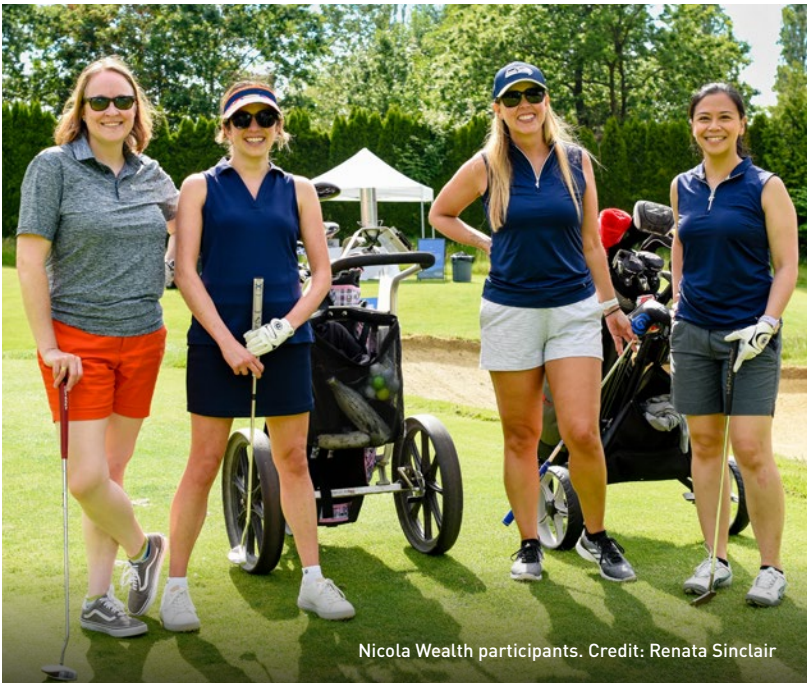
Nicola Wealth participants.