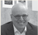
Tom Ferries Chair