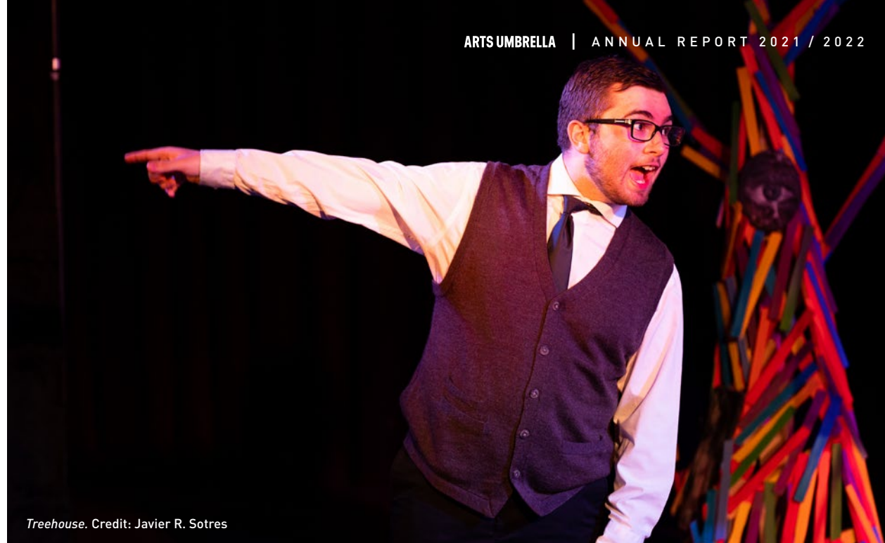
Treehouse.

2022's productions included SpongeBob SquarePants: The Musical and Tuck Everlasting (performed by the Musical Theatre Troupe), Kindness (performed by the Junior Theatre Troupe), Treehouse (performed by the Senior Theatre Troupe), and an original devised piece called Artificial Purpose (written and performed by the Laboratory Theatre Troupe).