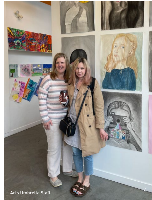
Arts Umbrella Staff