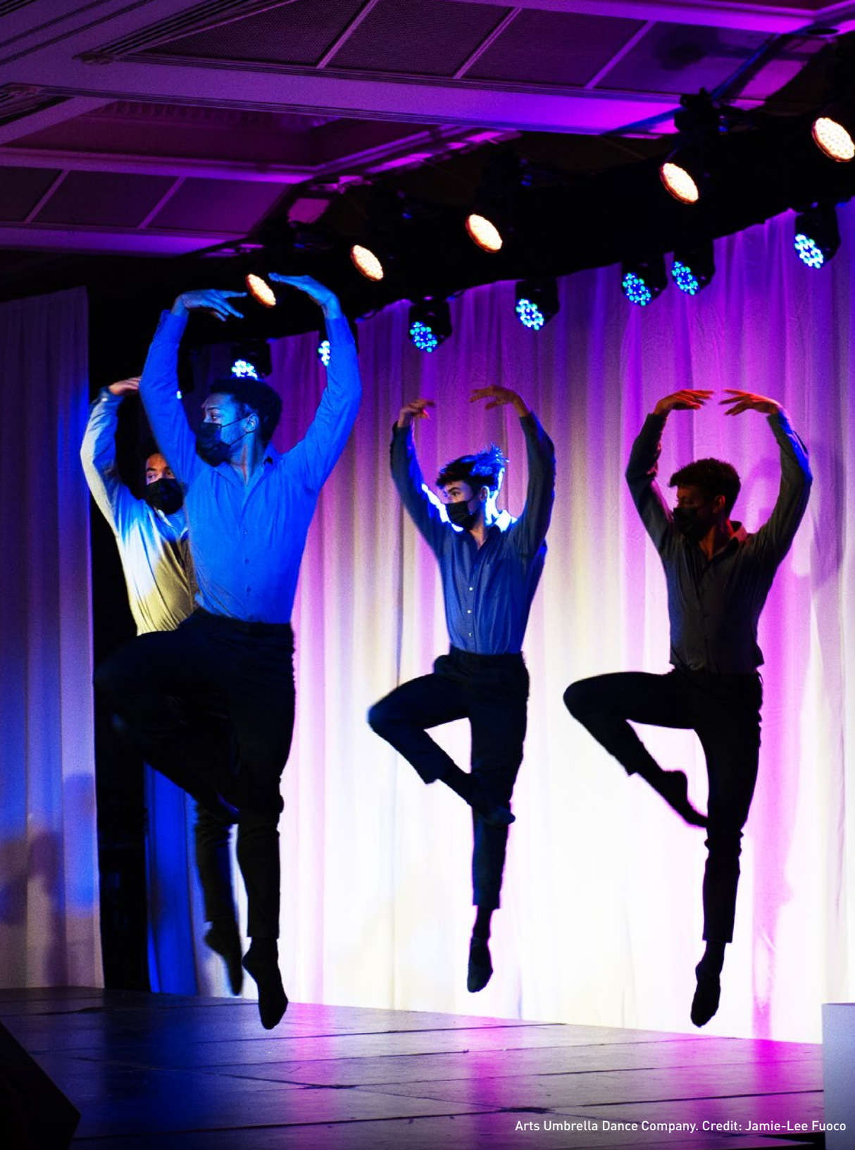
Arts Umbrella Dance Company.