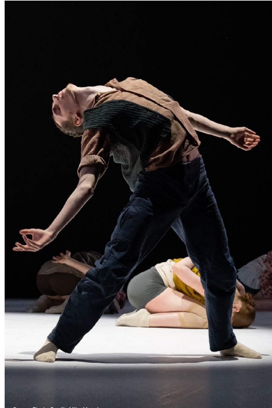
Season Finale.