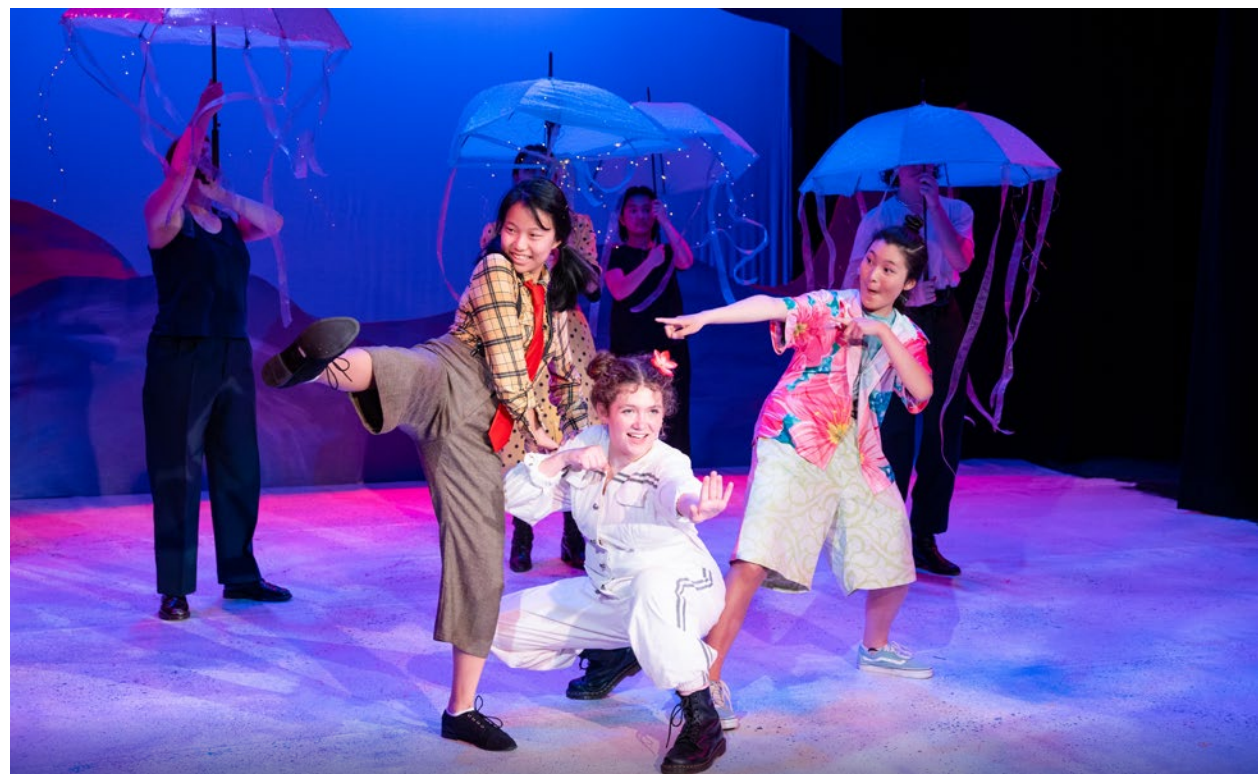
SpongeBob SquarePants: The Musical.