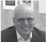
Tom Ferries Chair